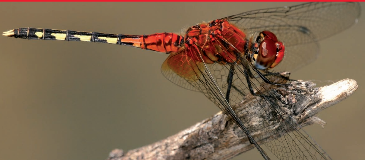
Diplacodes luminans - Least Concern